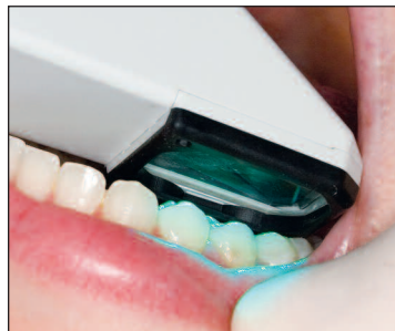
Cadent iTero wand in use intraorally.