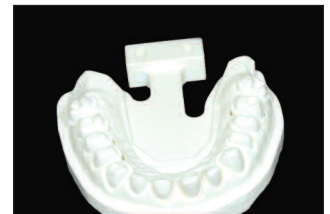
A full arch can be scanned, whether it is a single or multiple units.