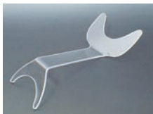
Photo Lip Retractor

One-piece clear plastic retractor has both an anatomical small and large end. Either end is used to push the front lip out of the way to easily photograph the mouth. Cold sterilization only.