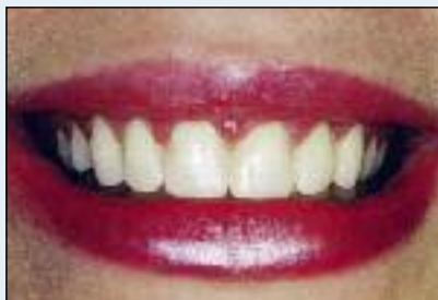
One piece Temporary made from Diagnostic Wax-up and Temporary Stent. No bonding required.

By comparing the Diagnostic Models with the Wax-up in conjunction with the technician, the practitioner can also determine such critical factors as tooth reduction requirements, pre-plan any gingival tissue recontouring or detect areas of uneven occlusal distribution – all well before actual preparation.