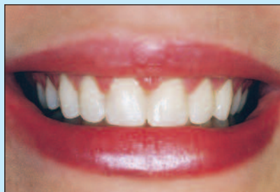
One piece Temporary made from Diagnostic Wax-up and Temporary Stent. No bonding required.

By comparing the Diagnostic Models with the Wax-up in conjunction with the technician, the practitioner can also determine such critical factors as tooth reduction requirements, pre-plan any gingival tissue recontouring or detect areas of uneven occlusal distribution – all well before actual preparation.