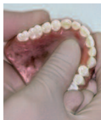
Denture base and teeth easily adjusted chairside at Try-in appointment.