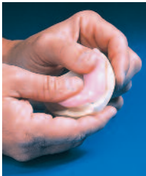
Technician forms final baseplate directly on Master Model.