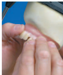
After Occlusal appointment, teeth set directly on baseplate.