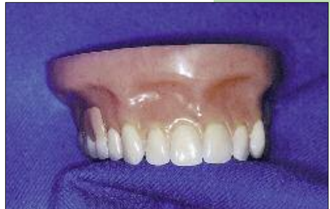
Completely tooth-borne Saddle-Lock® "Hidden Clasp" Vitallium® 2000 Cast Partial.

Utilizing the more pronounced natural mesial and distal undercut planes of the abutment teeth adjacent to the denture saddle, the clasp emergence is back at the casting finish line providing proper resiliency. The clasp terminals are positioned at the end of the denture saddle, effectively locking the segment to the ridge. This flexible design can be used with completely tooth-borne removable partial dentures and with both unilateral and bilateral distal extension appliances.