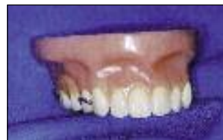
Unsightly conventional clasps.