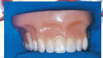
Completely tooth-borne partial upper denture.