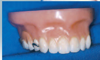
Unightly old conventional clasp upper partial denture.