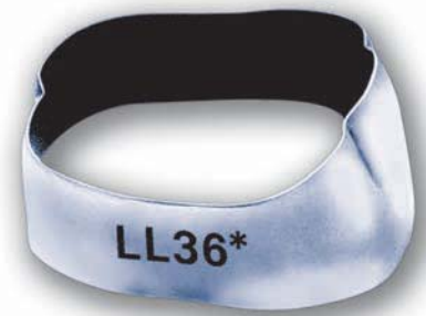
Maxillary Lingual Indent for a More Precise Fit!