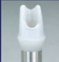
Custom Zirconia abutment.

Unsurpassed Experience • Outstanding Esthetics • Unrivalled Precision • Platinum-level Support