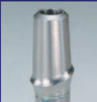
Custom Titanium abutment.