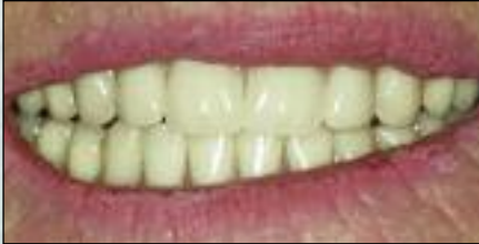
Smile restored with "Neuromuscular" dentures.