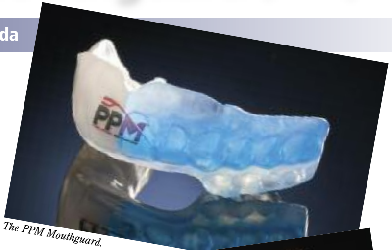
The PPM Mouthguard.