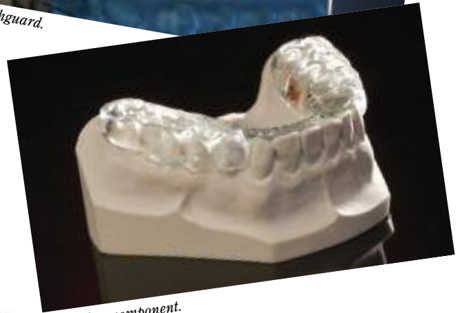
Lower jaw component.