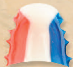
Red, White and Blue